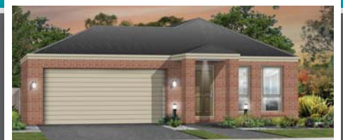
THE CHERMSIDE CLASSIC