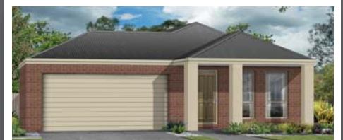
THE CHERMSIDE VILLA