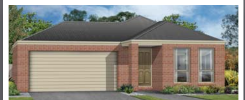
THE CHERMSIDE TRADITIONAL