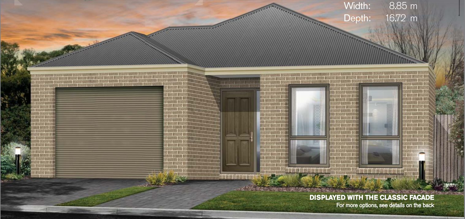
DISPLAYED WITH THE CLASSIC FACADE For more options, see details on the back