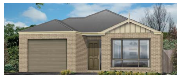
THE ADELINE. COLONIAL