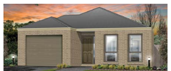
THE ADELINE. CLASSIC