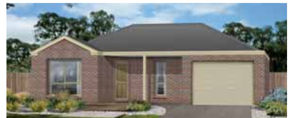
THE CASEY. COLONIAL