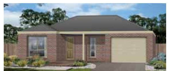
THE CASEY. CLASSIC