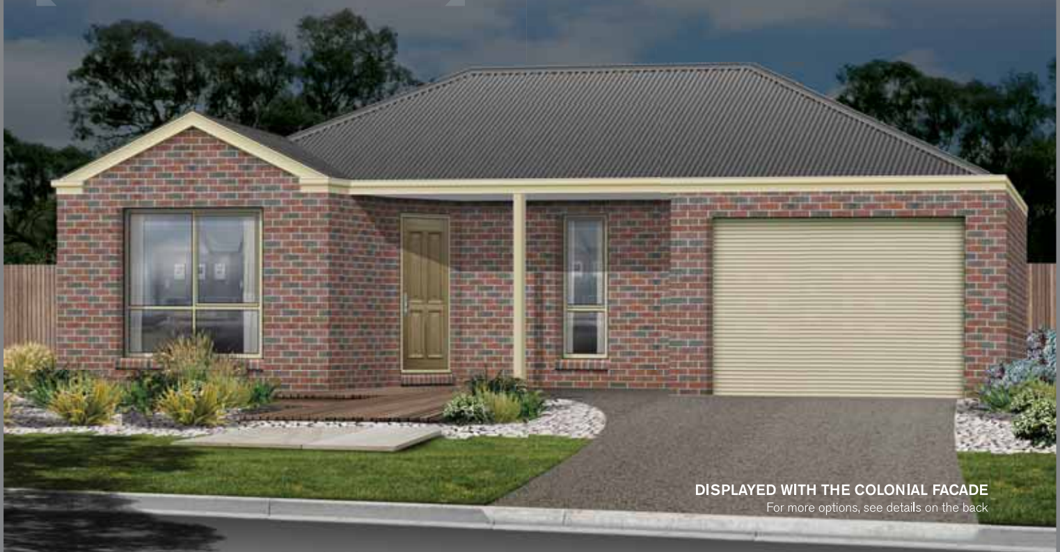
DISPLAYED WITH THE COLONIAL FACADE For more options, see details on the back