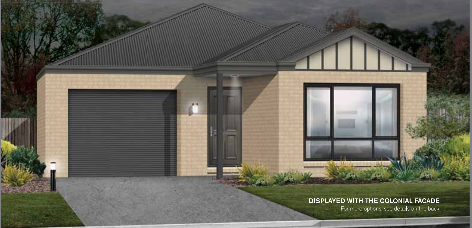
DISPLAYED WITH THE COLONIAL FACADE For more options, see details on the back