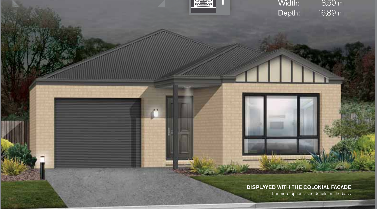
DISPLAYED WITH THE COLONIAL FACADE For more options, see details on the back