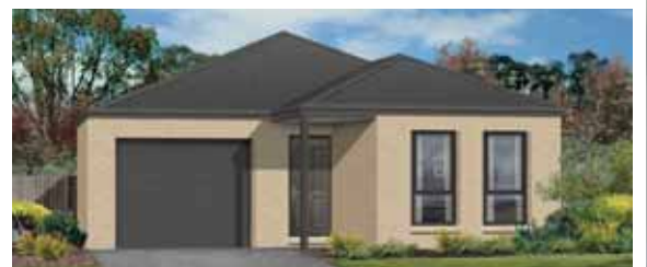
THE CASTELLE. CLASSIC