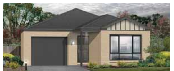
THE CASTELLE. COLONIAL