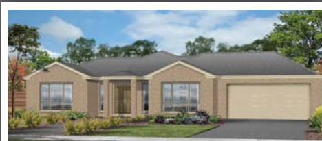
THE WINDSOR COLONIAL